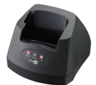
Modem Cradle Ethernet Cradle