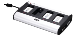
4-slot Battery Charger