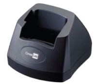
Charging & Communication Cradle